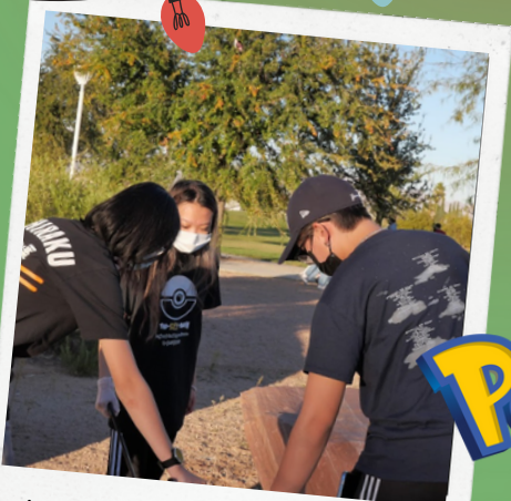
Ansan Sister City Park