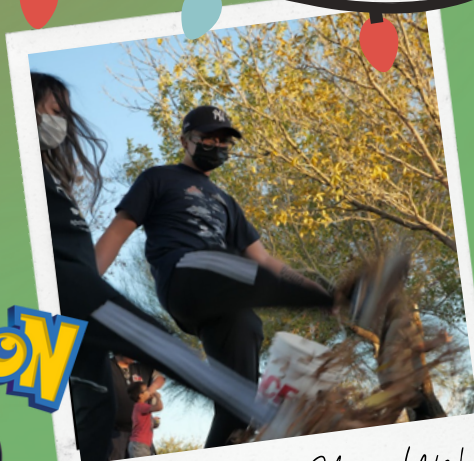
Pokémon Go Clean-Up!